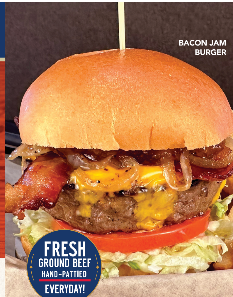
BACON JAM BURGER

A thick and juicy burger topped with a sweet and savory bacon jam, sautéed onions, bacon, mayonnaise, shredded lettuce, tomato and American cheese. • 13.19