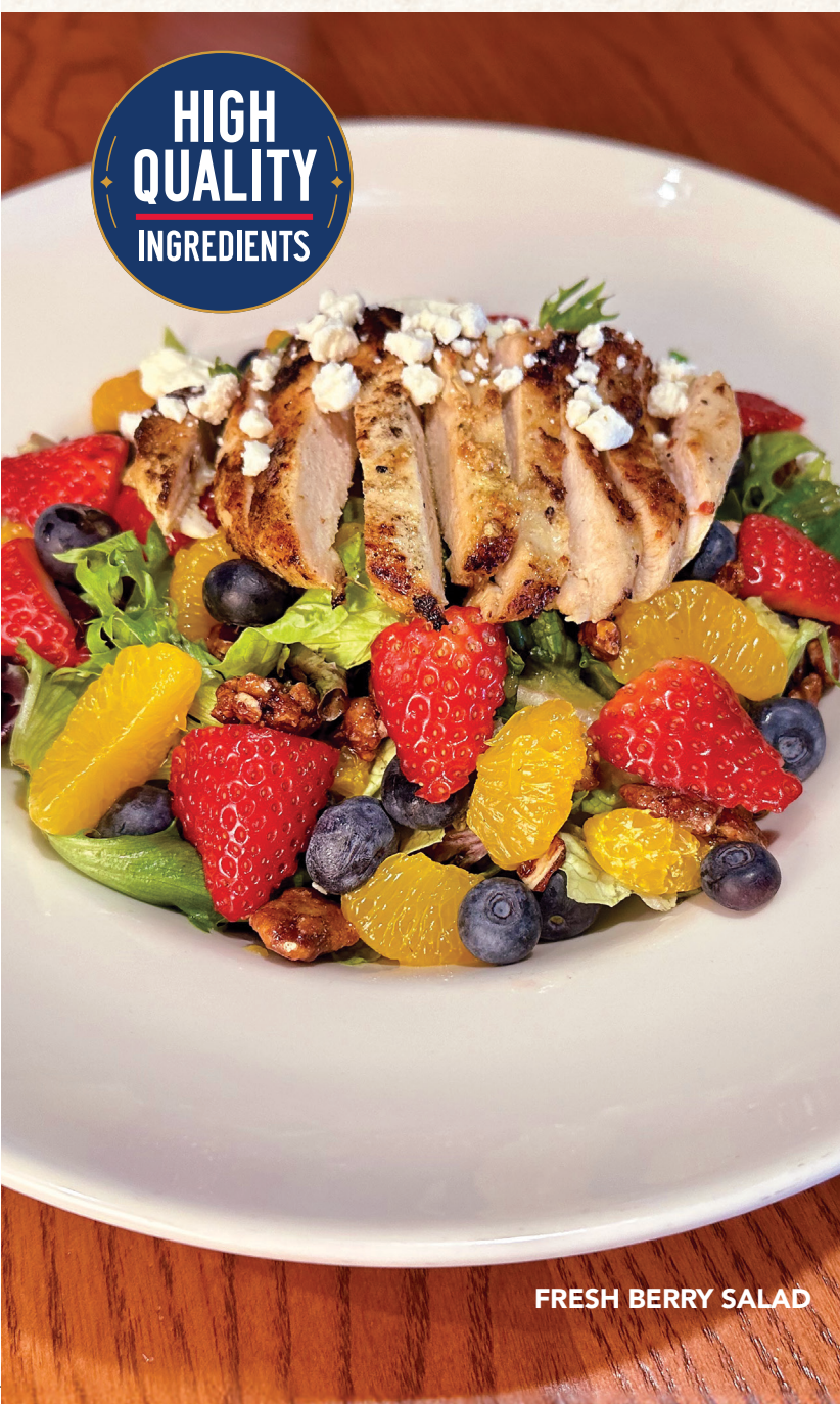
FRESH BERRY SALAD

* Items cooked to order. Consuming raw or undercooked meats, poultry, seafood, shellfish or eggs may increase your risk of foodborne illness.