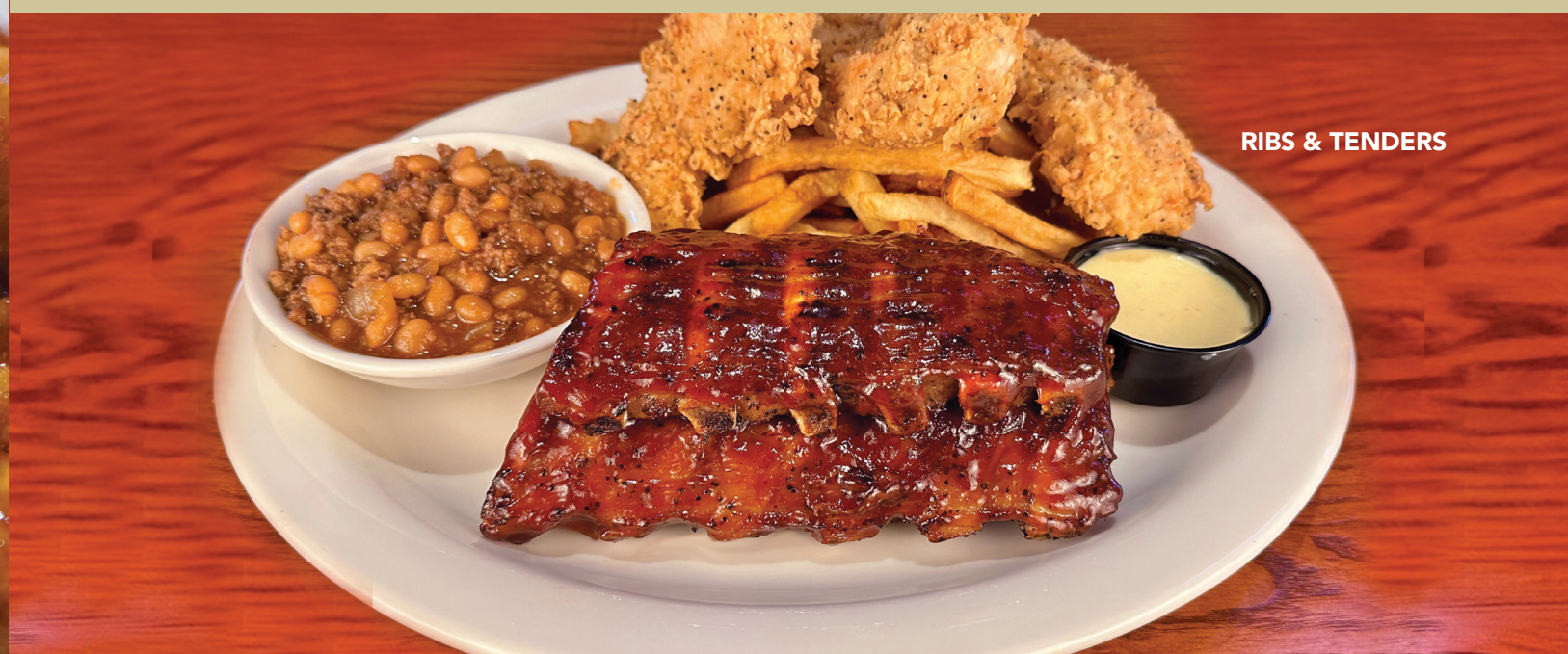
RIBS & TENDERS

Add a garden or Caesar salad 4.69 • Add grilled shrimp 6.99 • Add fried shrimp 6.99 • Add sauteed mushrooms 2.99