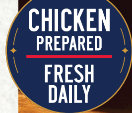
COMBO CAJUN ALFREDO PASTA

Crisp tortilla stuffed with chicken, mixed cheeses, bacon, barbecue sauce and ranch. Served with shredded lettuce, pico de gallo and sour cream • 9.19