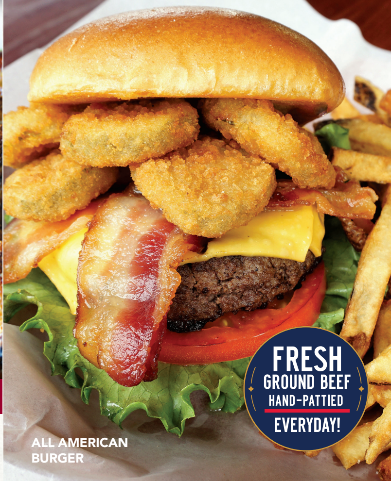
ALL AMERICAN BURGER

ALL-AMERICAN BURGER* Topped with lettuce, tomato, bacon, American cheese, fried pickles and mayonnaise • 9.39