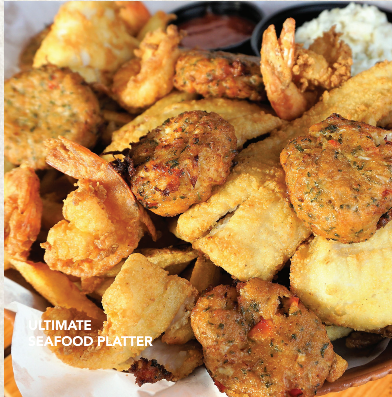
ULTIMATE SEAFOOD PLATTER

Fried chicken tenders tossed in Buffalo sauce with pico de gallo, onions, lettuce, mozzarella and provolone cheese and ranch dressing rolled up in a warm tortilla. Served with fresh hand-cut fries • 8.99