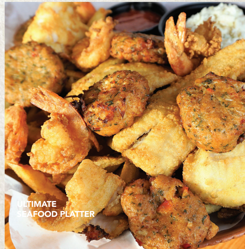
ULTIMATE SEAFOOD PLATTER

Fried chicken tenders tossed in Buffalo sauce with pico de gallo, onions, lettuce, mozzarella and provolone cheese and ranch dressing rolled up in a warm tortilla. Served with fresh hand-cut fries • 8.99