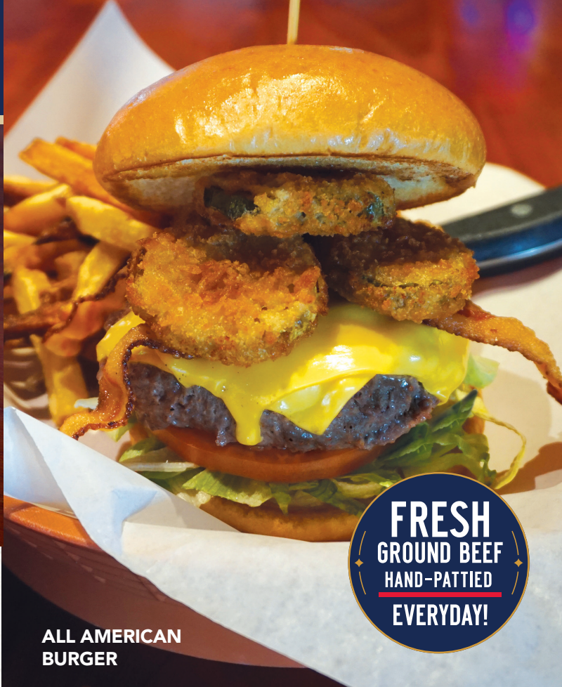
ALL AMERICAN BURGER

ALL-AMERICAN BURGER* Topped with lettuce, tomato, bacon, American cheese, fried pickles and mayonnaise • 9.59