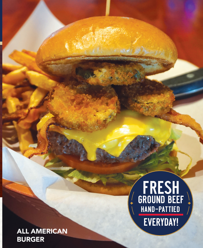
ALL AMERICAN BURGER

Topped with lettuce, tomato, bacon, American cheese, fried pickles and mayonnaise • 11.19