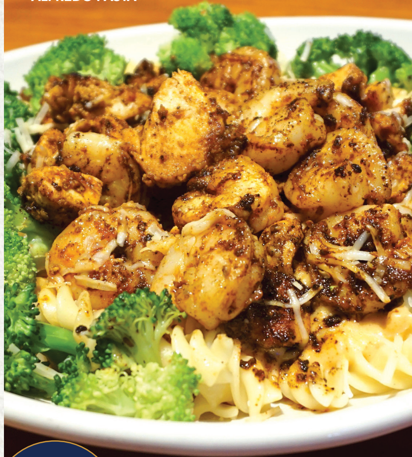
COMBO CAJUN ALFREDO PASTA

Cajun grilled chicken, shrimp, andouille sausage, roasted red peppers and onions served over fusilli pasta in a spicy Cajun cream sauce and then topped with grated Parmesan cheese • 12.29