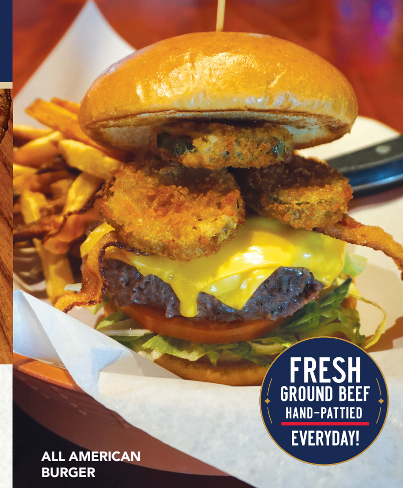
ALL AMERICAN BURGER

Topped with lettuce, tomato, bacon, American cheese, fried pickles and mayonnaise • 11.19