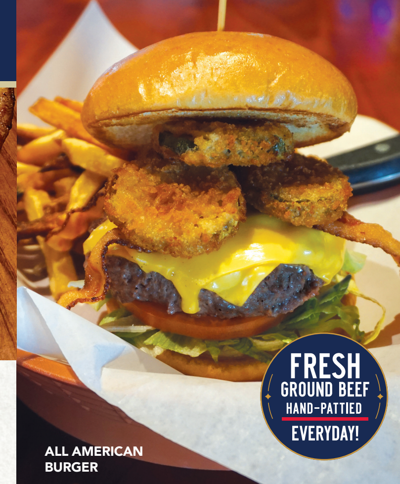
ALL AMERICAN BURGER

Topped with lettuce, tomato, bacon, American cheese, fried pickles and mayonnaise • 11.39