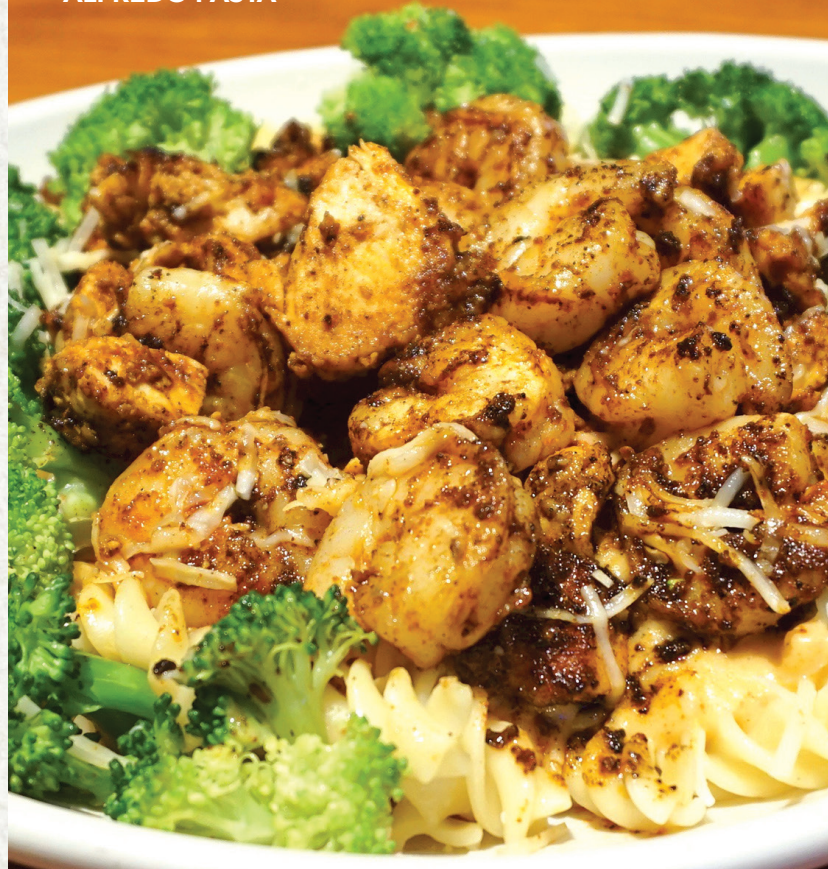
COMBO CAJUN ALFREDO PASTA

Cajun grilled chicken, shrimp, andouille sausage, roasted red peppers and onions served over fusilli pasta in a spicy Cajun cream sauce and then topped with grated Parmesan cheese • 12.99