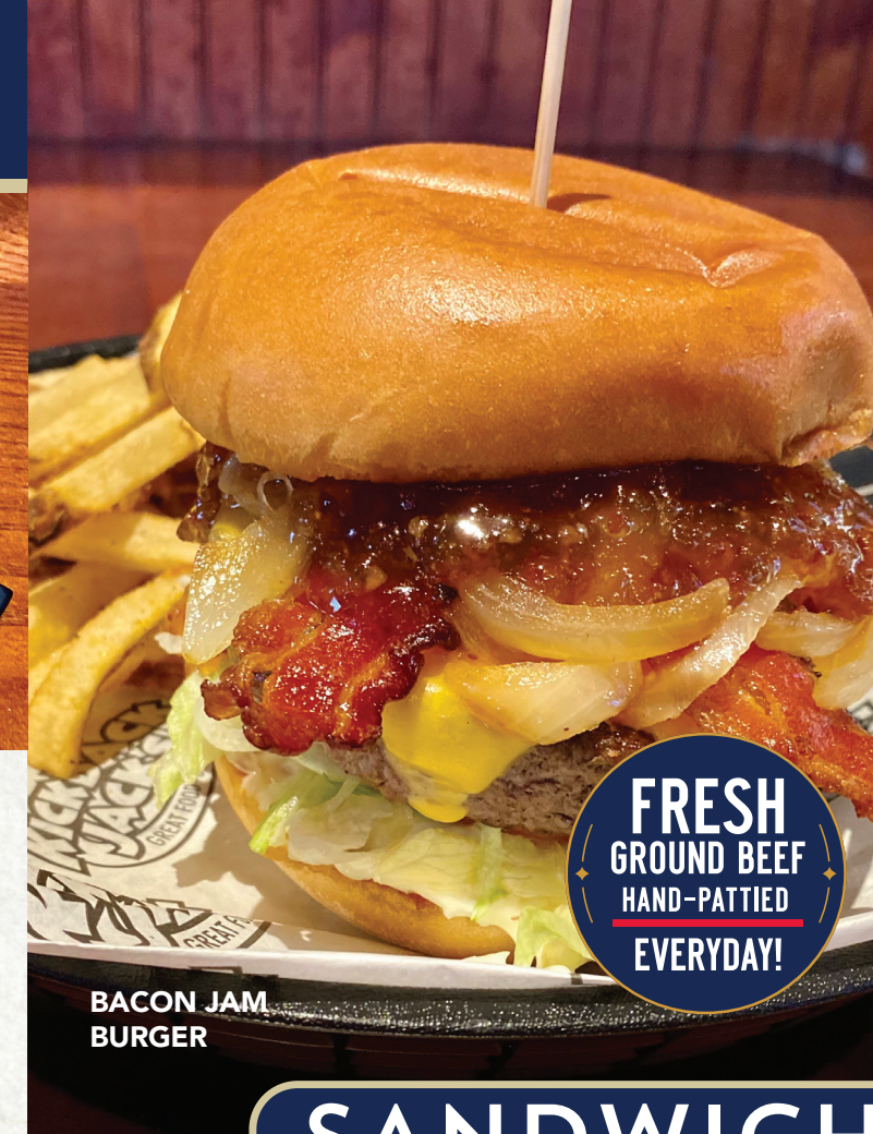
BACON JAM BURGER

A thick and juicy burger topped with a sweet and savory bacon jam, sautéed onions, bacon, mayonnaise, shredded lettuce, tomato and American cheese. • 11.99