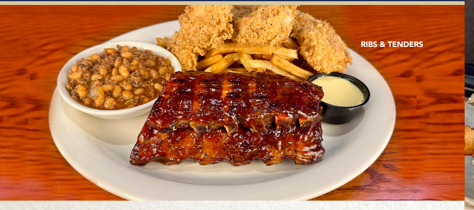
Add a garden or Caesar salad 4.29 • Add grilled shrimp 6.99 • Add fried shrimp 6.69 • Add sauteed mushrooms 2.99

Items cooked to order. Consuming raw or undercooked meats, poultry, seafood, shellfish or eggs may increase your risk of foodborne illness.