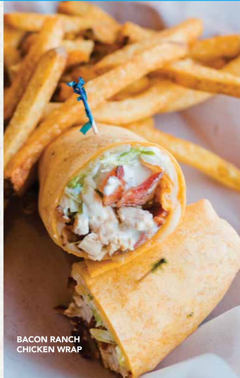
BACON RANCH CHICKEN WRAP

Chicken, mixed cheeses, shredded lettuce, bacon and ranch rolled in a fresh tortilla wrap. Served with fresh hand-cut fries • 9.19