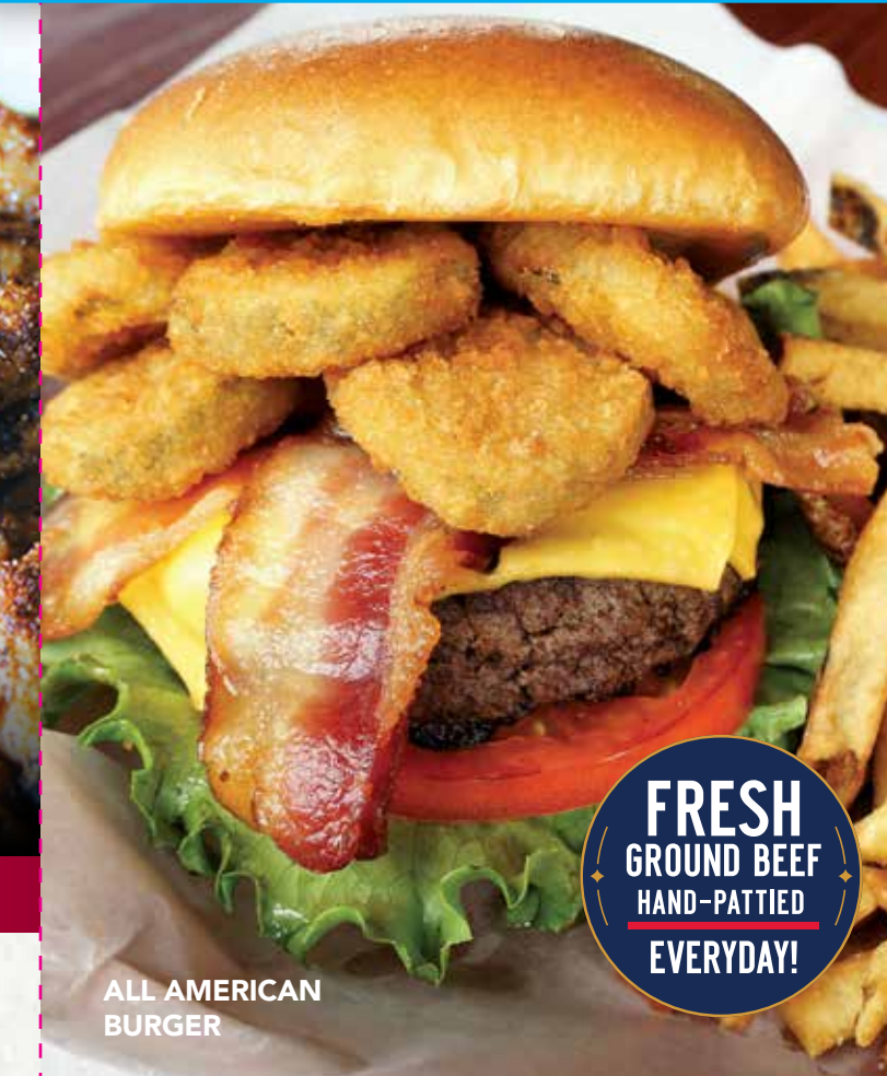
ALL AMERICAN BURGER

Topped with lettuce, tomato, bacon, American cheese, fried pickles and mayonnaise • 9.69