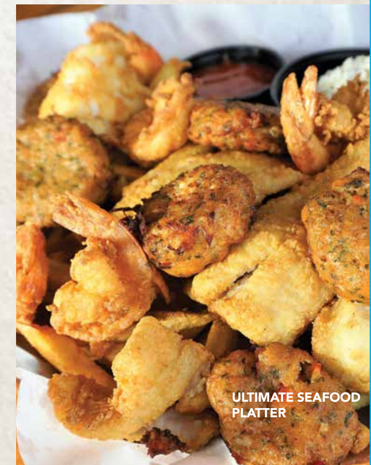
ULTIMATE SEAFOOD PLATTER

Delicate, flaky flounder fillet lightly breaded, finished to a golden perfection and served with fresh hand-cut fries and homemade coleslaw • 10.79