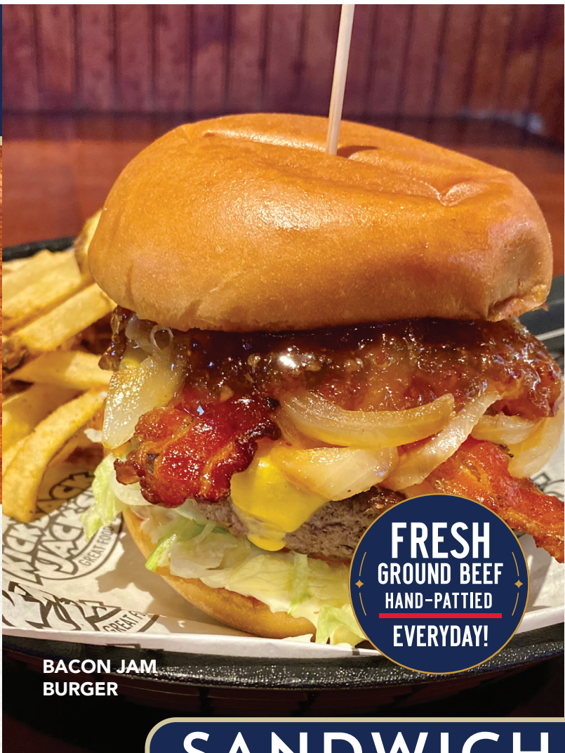
BACON JAM BURGER

A thick and juicy burger topped with a sweet and savory bacon jam, sautéed onions, bacon, mayonnaise, shredded lettuce, tomato and American cheese. • 11.99