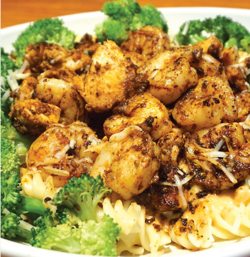
COMBO CAJUN ALFREDO PASTA