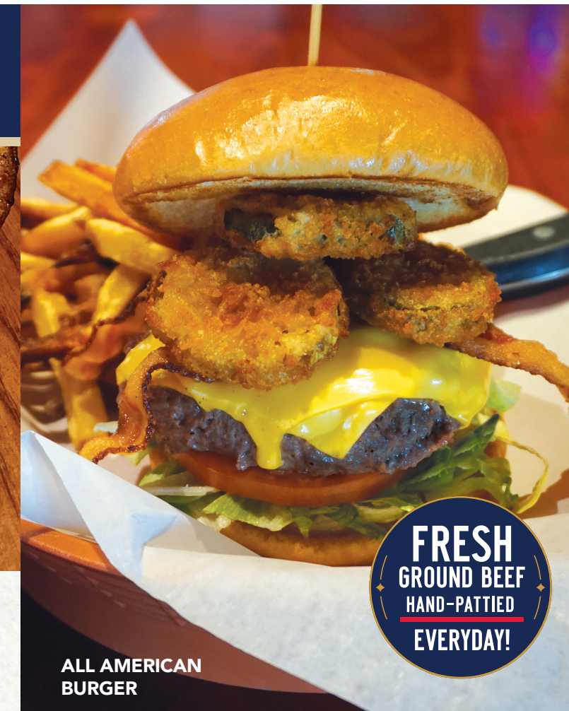
ALL AMERICAN BURGER

Topped with lettuce, tomato, bacon, American cheese, fried pickles and mayonnaise • 10.89