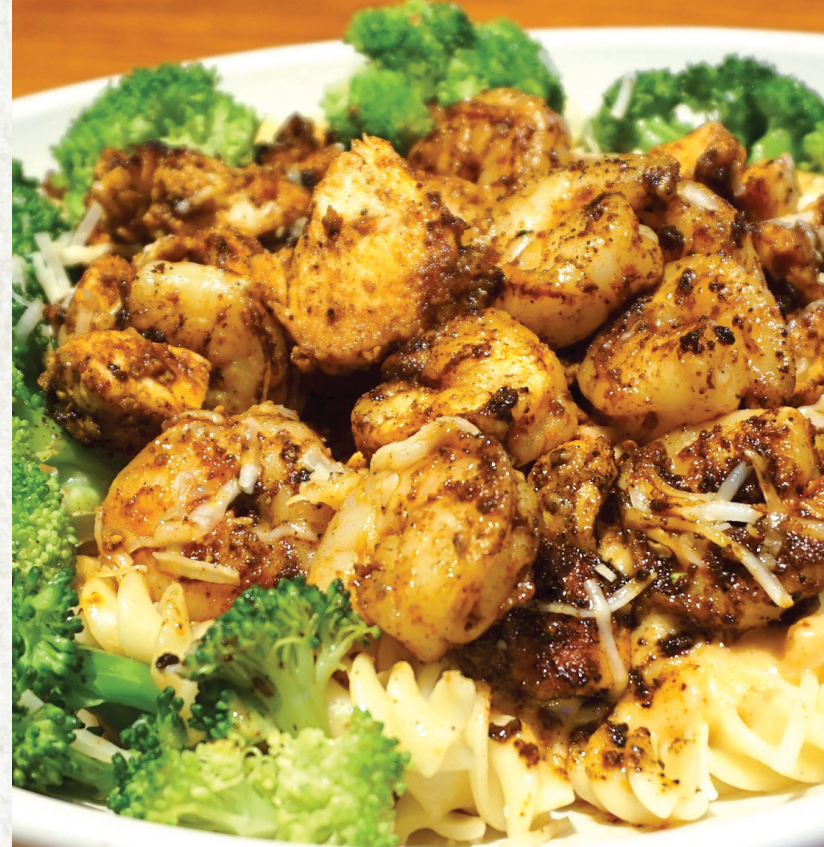
COMBO CAJUN ALFREDO PASTA