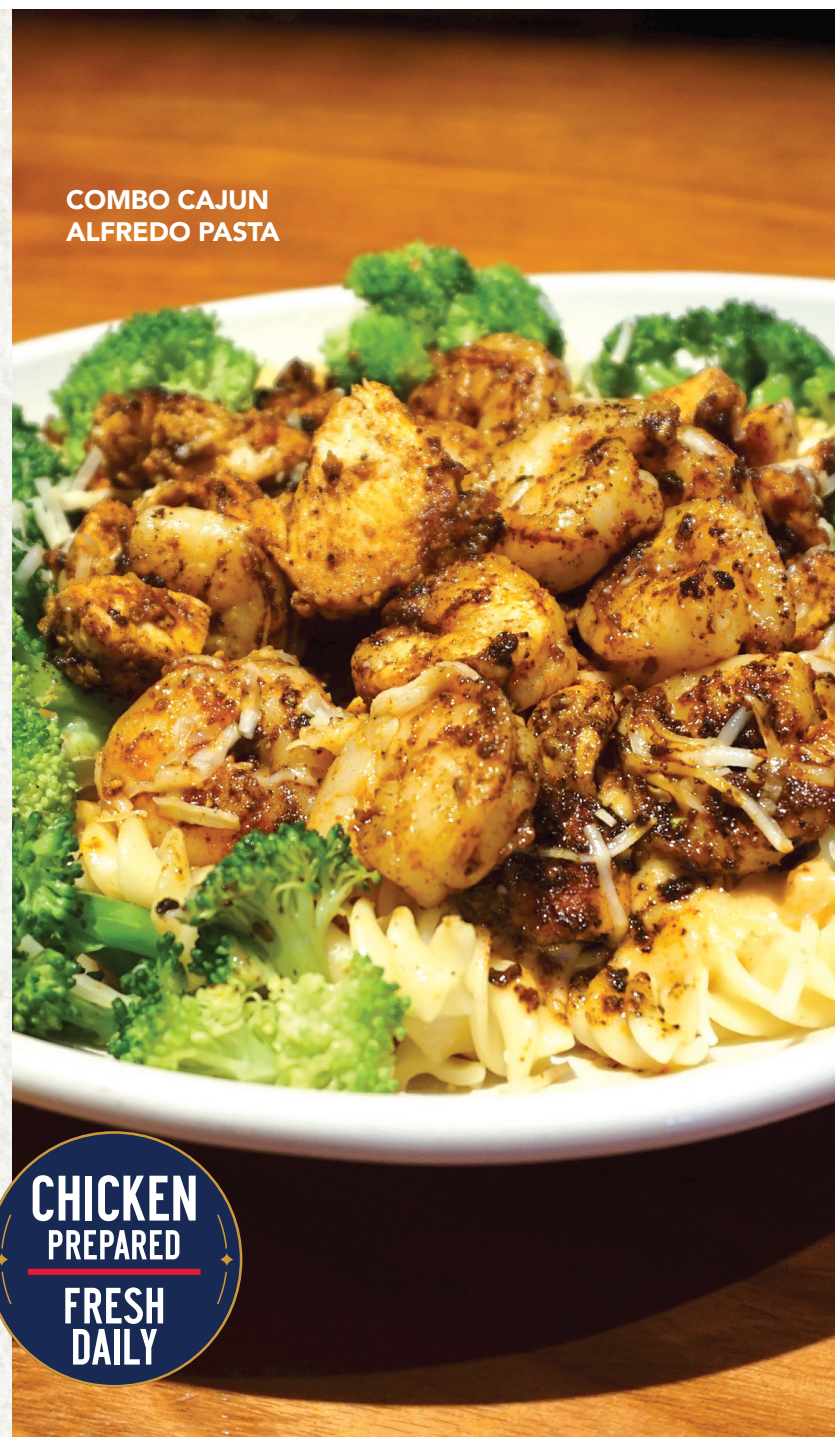
COMBO CAJUN ALFREDO PASTA