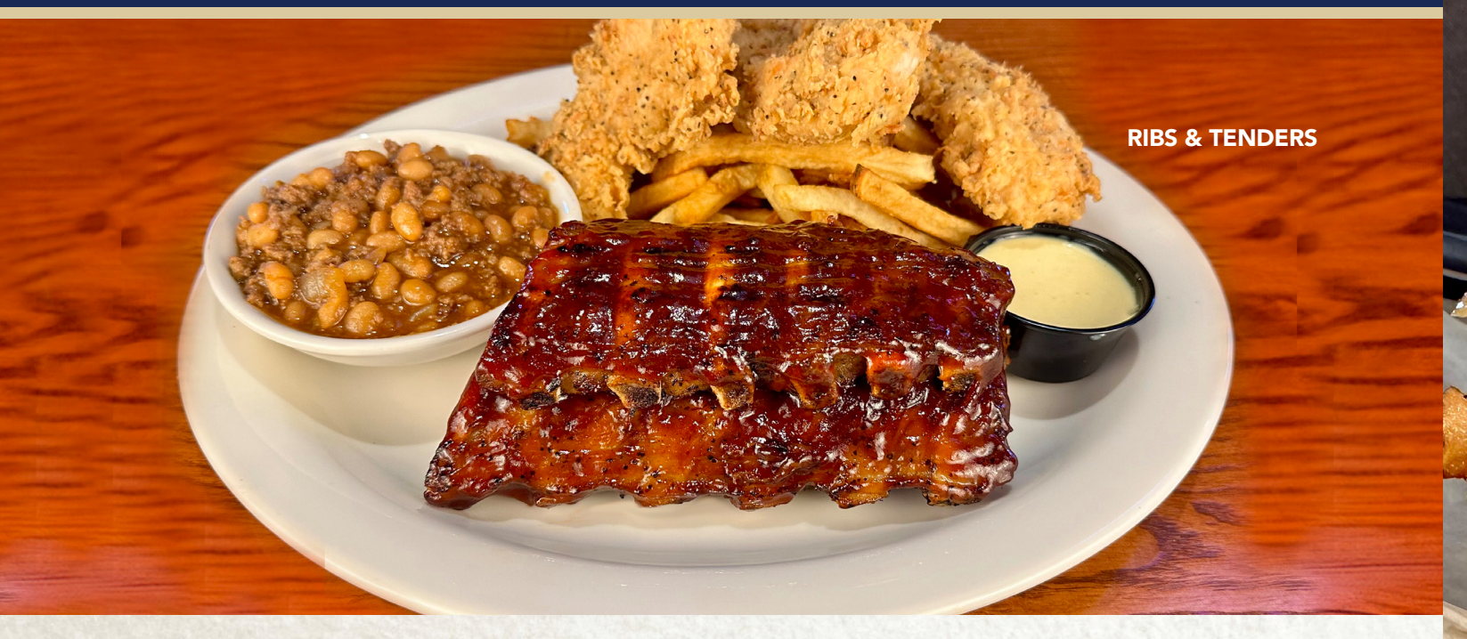
Add a garden or Caesar salad 4.49 • Add grilled or fried shrimp 6.99 • Add sauteed mushrooms 2.99