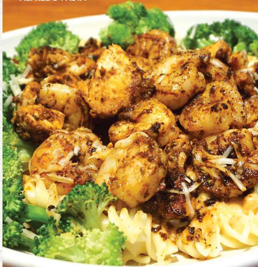
COMBO CAJUN ALFREDO PASTA