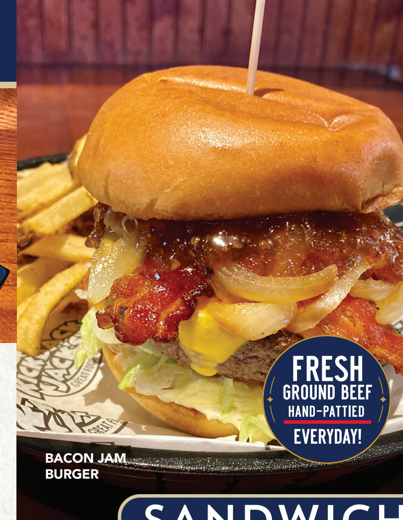
BACON JAM BURGER

A thick and juicy burger topped with a sweet and savory bacon jam, sautéed onions, bacon, mayonnaise, shredded lettuce, tomato and American cheese. • 11.99